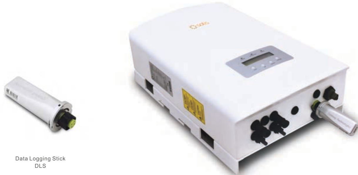
Data Logging Stick DLS